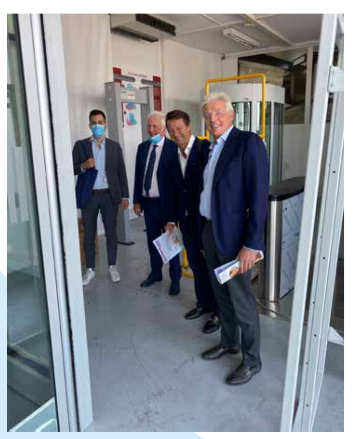
Spotlight on our most requested access control systems.