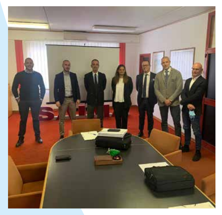
In Switzerland for an important meeting with GAP.