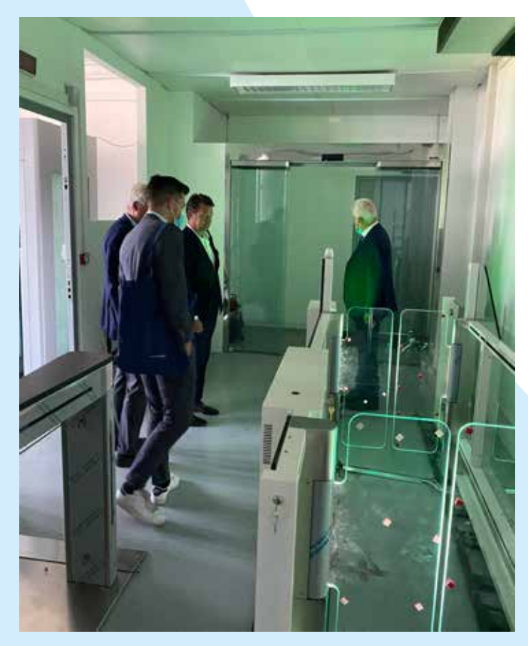
The management of PROGENIA visiting our showroom in Arezzo.