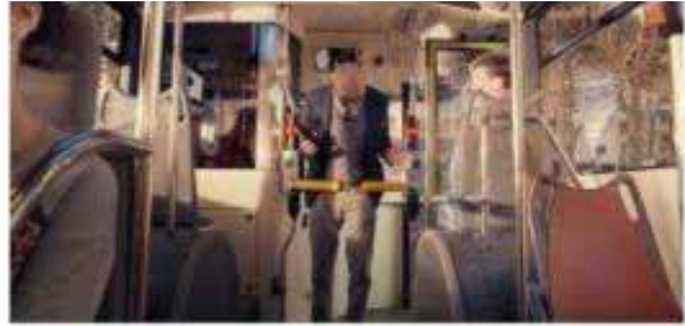
STRONG, DETERRENT AND FUNCTIONAL

WELC'ON BUS is already successfully used on the buses of the e 14 line, which links the Reims-Sebastopol area to the Neuville quarter. A shout out, then, to our cousins from across the Alps, who recognised and appreciated our simple but effective system for a novel way of travelling.