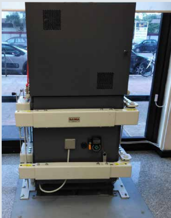
UNICREDIT installation in Bari

NOCASH 350/409 (this is the trade name of the cage) features a particularly strong steel structure, which has successfully passed explosion tests carried out using gaseous and solid explosives (penthrite), as well as anchoring tests. Optionally, it can also be fitted with a special tear-proof plate. Thanks to these features, our product is proving very successful even abroad, like in Spain. We received many orders, as our solution protects the ATMs with a cage, enhancing the security of the service!