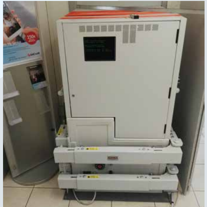
UNICREDIT installation in Cecina

Gangs and all sorts of thieves are targeting the ATM service, and many banks are placing urgent orders for our famous "security cages". But La Spezia and S. Miniato, with their supermarkets and post offices, are not the only towns on the front line: the following is one of the many articles that are published every day in our newspapers to alert people and banks. Needless to say, SAIMA SICUREZZA keeps working to ensure the security of this important service: for many years we have been designing solutions aimed at protecting this important and valuable public service. Data from OSSIP, the ABI security watchdog of which we are members, clearly show the current state of affairs. Attacks are getting more and more frequent, despite the various video security technologies and the different systems available, and a physical defence is a must - Alessandro Catalani, Sales Director of SAIMA SICUREZZA for Italy, confirms us -. The "cage" is a necessary and essential tool to defend these machines. For over 10 years we have been producing this ATM protection system; our experience and the innovations we developed have allowed us to be market leaders for this product too, with over 1000 devices already delivered: a feat we are proud of.