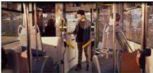
MINIMAL FOOTPRINT DURING OPENING AND CLOSING