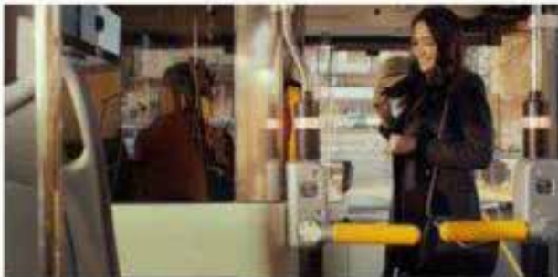
SIMPLE AND FUNCTIONAL ACCESS