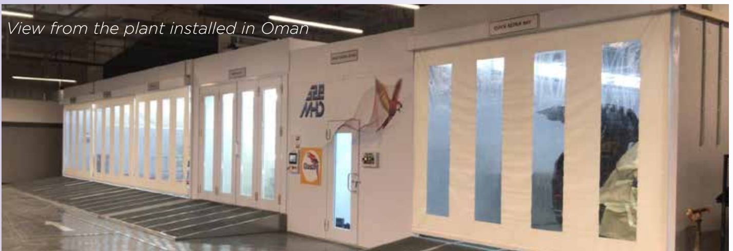
View from the plant installed in Oman

In Oman SAIMA MECCANICA has successfully established a partnership with MOHSIN HAIDER DARWISH LLC. A first step towards a more sustained cooperation with a sultanate that is trying to seize new business opportunities, getting closer to the Western world in terms of trade and life standards. The government of this small state (about 2,000,000 inhabitants) has recently started an economic diversification process based on the exploitation of resources other than oil ; since 2000, in addition, Oman has been a member of the World Trade Organization and since 2006 it has been a close ally of the United State, with which it trades freely. This country, which has been a British protectorate until 1971, has a young population, where almost 90% is under 65; in addition its growth rate exceeds 2%, while alphabetisation is as high as 80%. A market yet to be tapped in the small but important Arab state, which guards its traditions and culture but that watches with interest any business development that can help it grow.