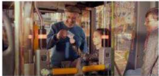
ADAPTABLE AND SUITABLE FOR ANY SITUATION