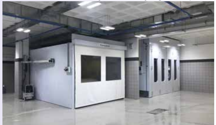
A detail of the installation in Jordan.

Jordan, the country that hosts the ruins of Petra, the wonderful rose city rich in temples and monuments, is watered by the namesake river. It is a constitutional monarchy that is trying to improve its infrastructure and increase its average income, and anyway one of the most developed countries in the area, where for example most inhabitants can speak English. Amid this mix of modernity and traditions we established a business partnership with MAHMOUDIA MOTORS. The picture shows a system consisting of a THESIS A booth with endothermic panel, a double preparation area and a polishing area, as well as a set of endothermic panels. A stylish and effective solution, allowing to paint anywhere ... from the banks of the Jordan river to those of the Wadi Rum desert!