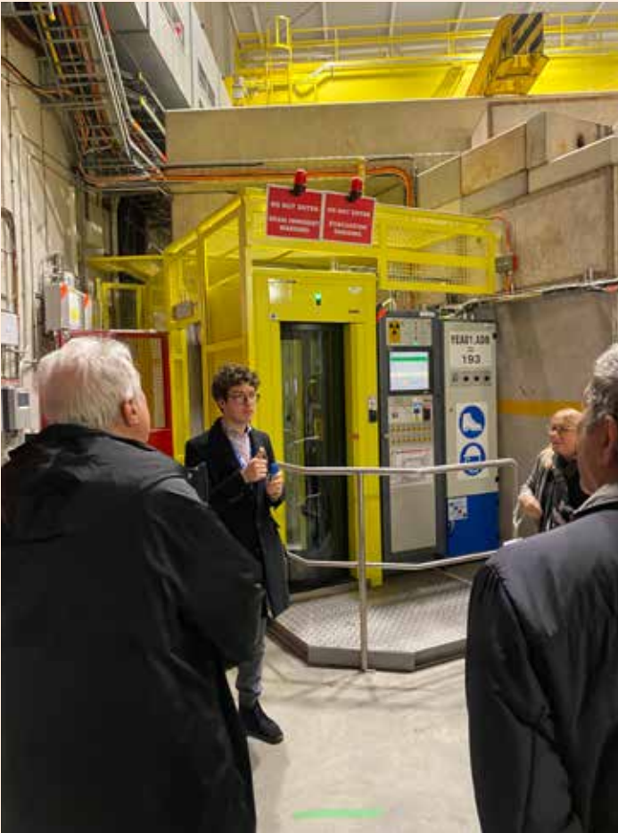
Moments of the tour

The current Director of Cern is the Italian professor Fabiola Gianotti, and we are all proud of her because, today more than ever, we are finally discovering how even in Italy, talented female students of Scientific Institutes are increasingly distinguishing themselves for their skills in STEM subjects. During our tour we were able to see one of our security doors in action , which controls a very specific sector of the pre-established area. The door is yellow, because each zone is represented by a specific colour, depending on the danger level of the area. Our systems are defined by the abbreviations PAD (Person Access Control) and MAD (Material Access Control). Of course, the passage through the PAD is always for only one person at a time, with various differentiated biometric systems, depending on the need for security. For the MAD, a software identifies the actual presence of only inanimate matter, before authorising the opening of the system.