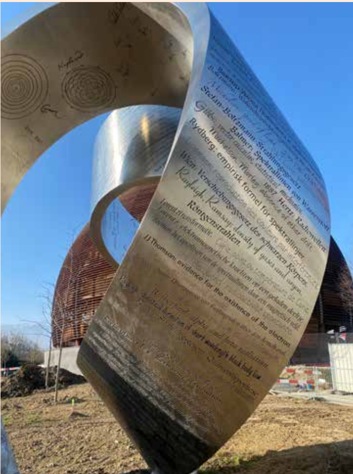
Knowledge and art at Cern

The current Director of Cern is the Italian professor Fabiola Gianotti, and we are all proud of her because, today more than ever, we are finally discovering how even in Italy, talented female students of Scientific Institutes are increasingly distinguishing themselves for their skills in STEM subjects. During our tour we were able to see one of our security doors in action , which controls a very specific sector of the pre-established area. The door is yellow, because each zone is represented by a specific colour, depending on the danger level of the area. Our systems are defined by the abbreviations PAD (Person Access Control) and MAD (Material Access Control). Of course, the passage through the PAD is always for only one person at a time, with various differentiated biometric systems, depending on the need for security. For the MAD, a software identifies the actual presence of only inanimate matter, before authorising the opening of the system.