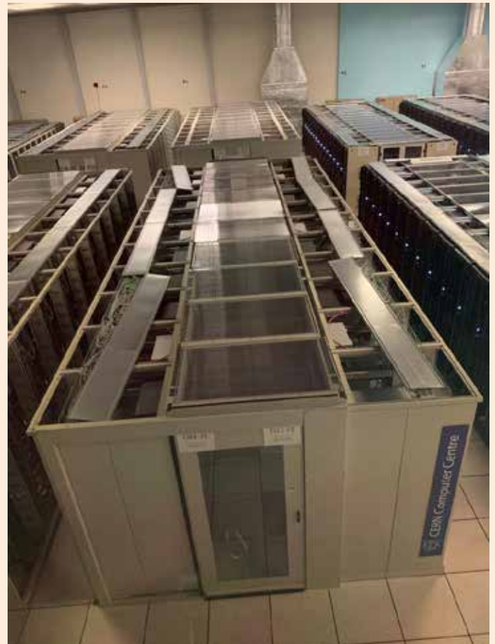
Detail of the Computer Centre