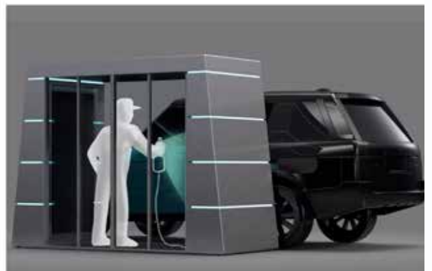
SPOT REPAIR MODE