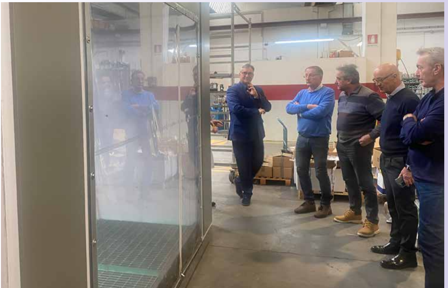
SRS functionalities are explained to the staff of Saima Meccanica