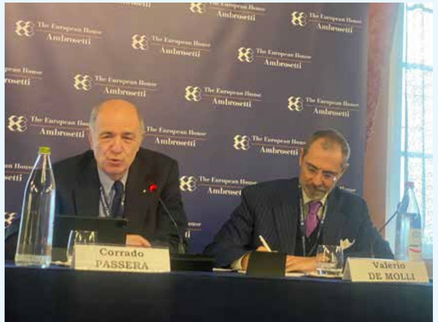
Moments of the meeting with Corrado Passera

Corrado Passera's speech regarding "Scenarios for SMEs in the current context and the relationship with the banking system" filled the majestic hall of the historic building with attentive entrepreneurs. Corrado Passera, what a character! He is, of course, Cavaliere del Lavoro (Order of Merit for Labour) and in his 68 years of life he has held the most prestigious positions in our country. Former Minister of Economic Development and Infrastructure and Transport during the Monti government, he explains "ILLIMITED", the specialised and technological Banking-Entrepreneurial Group born with the aim of supporting SMEs by enhancing their potential.