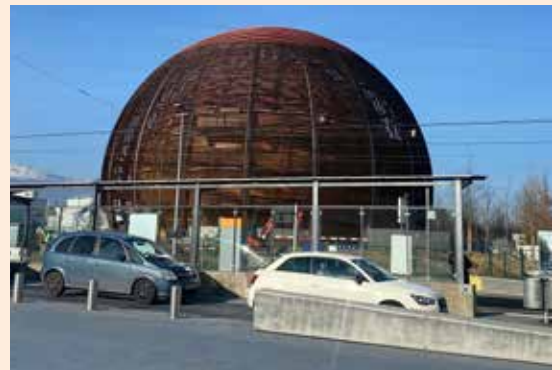
Detail of one of the buildings that make up the CERN structure

Since 1953, the European Laboratory of Particle Physics has been promoting the cooperation of European countries for exclusively peaceful purposes, in the sector of nuclear and particle physics. On the France-Switzerland border, right on the outskirts of Geneva, is CERN, one of the most famous laboratories in the world. 2,500 researchers and technicians are employed here for scientific research, in collaboration with 14,000 researchers from all over the world. For about 70 years now, CERN has been a point of reference for almost all discoveries regarding the structure of matter: its origin, the type of particles that compose it and the forces that keep them together. Even “Internet” was born at CERN. It has 50 coordinated Data Centres! But what is the universe made of? Where is it from? These big questions occupy the minds of the most famous researchers and scientists, now and always, in search of the big answers to the mystery surrounding us. Saima Sicurezza was given the honour of giving about 50 of its security systems, designed and produced specifically for even the most “dangerous” rooms, forbidden to access by a “normal” public. Every day, in fact, many tourists from all over the world arrive in this citadel of science: scholars, university professors, students and scientists visit the various sectors that make up this “planet of the study of the universe” with small packaged bus tours.