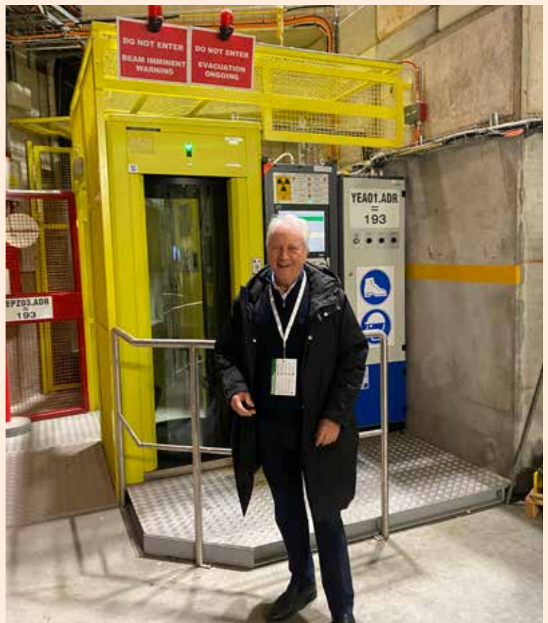
One of our access control security systems.