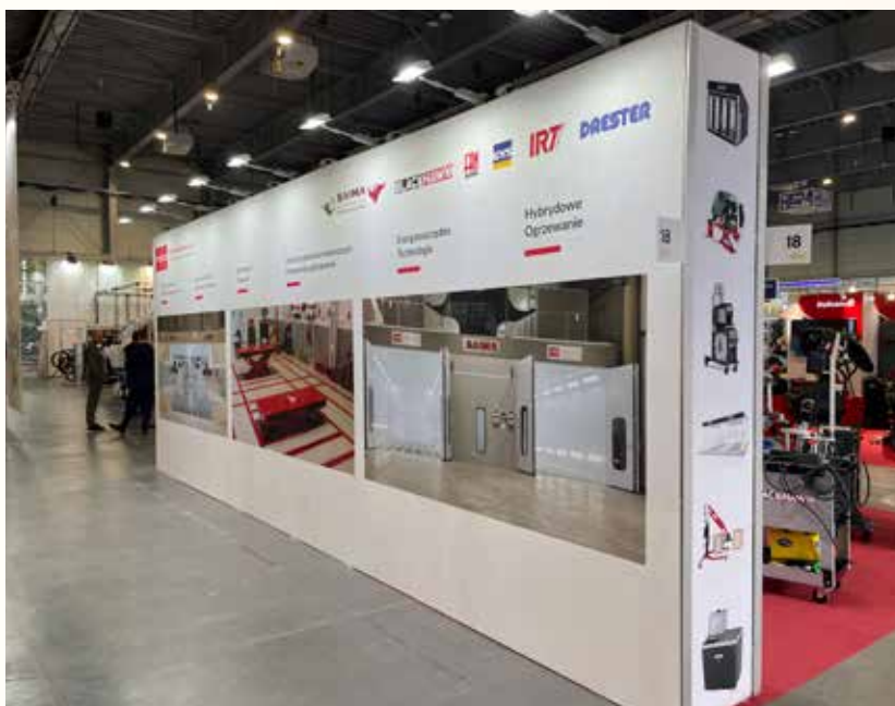
A detail of the stand.