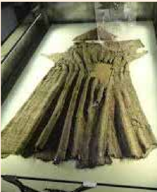
The relic of St. Francis kept in the Chapel of Relics.

St. Francis are kept. On the floor there is a plaque that marks the point where the "miracle of the stigmata" received from the Saint took place. But the true mystery that defies the force of gravity and the normal rules of gravitational balance lies in standing before the " Sasso Spicco " where the "poor man of Assisi" used to kneel in prayer in front of the granite mountain. Even today, that protrusion of suspended stone continues to defy gravity. And there is no architect who knows how to find a rational answer to this extraordinary miracle of nature. Go and see it!