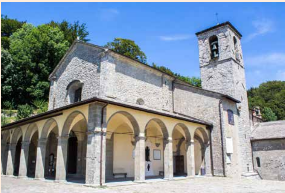
The Basilica of La Verna.

Anyone who does not know La Verna and the famous Sanctuary has missed the opportunity to visit one of the most beautiful and magical places in the Casentino Forests. Centuries-old beech forests immersed in the Franciscan setting par excellence welcome and invite us to visit the most secret sites of the sanctuary where St. Francis lived and died. The walking tour includes seven to ten kilometres for a journey of true spirituality amidst the temple of nature that has remained unspoiled. 14 September 1224 marks the history of La Verna, since then a destination for thousands of visitors from all over the world. Art, faith, culture and history of the life of St. Francis will remain unchanged over time, with the historical and monumental testimonies of the church of S. Maria degli Angeli (1250-1260) and of the Basilica of S. Maria Assunta (1348). It is important to visit the Chapel of Relics, where the remains of