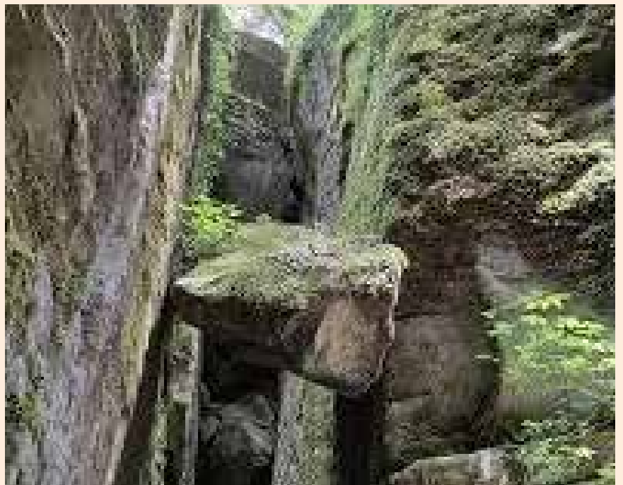
The famous Sasso Spicco that defies the force of gravity.