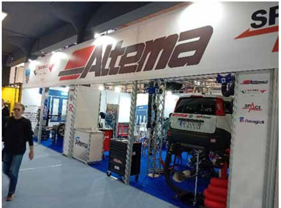
Our stand at the trade fair.

With Saima Meccanica we entered into a partnership that included joint participation in the important "BG Car Show 2024", essentially the most popular and famous trade fair for the automotive sector in the Balkan countries together with the one that takes place in Plovdiv (Bulgaria)".